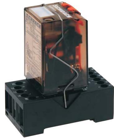
Mounting height 85 mm